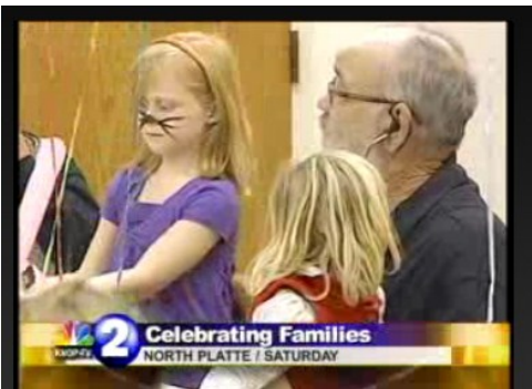
Creating fun with Dad at the carnival in Beautiful Savior Lutheran Church at North Platte's very first celebration.